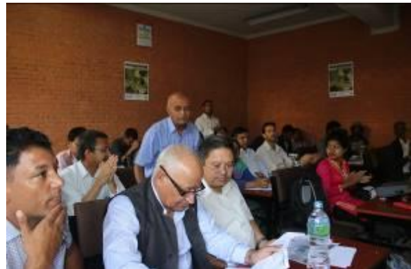
Guest in front line